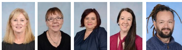
Some Tips from the MHPS Wellbeing Team

Meadow Heights Primary School is a School Wide Positive Behaviour Support (SWPBS) school. We ask students to follow the school's values by being PROUD, RESPECTFUL, EXCELLENT and RESPONSIBLE.