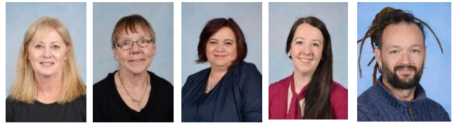
Some Tips from the MHPs Wellbeing Team

Meadow Heights Primary School is a School Wide Positive Behaviour Support (SWPBS) school. We ask students to follow the school's values by being PROUD, RESPECTFUL, EXCELLENT and RESPONSIBLE.