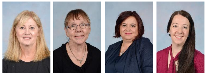
Some Tips from the MHPS Wellbeing Team

Meadow Heights Primary School is a School Wide Positive Behaviour Support (SWPBS) school. We ask students to follow the school's values by being PROUD, RESPECTFUL, EXCELLENT and RESPONSIBLE .